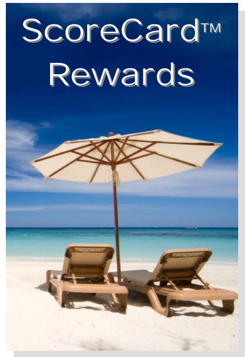
Amazing Travel Awards

http://www.mcu.org or https://www.scorecardrewards.com